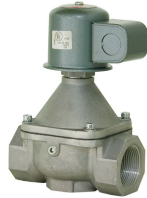
3SVM-25 TO 16SVM-25

Maximum Operating Pressure Differential ..... 25 to 30 psi